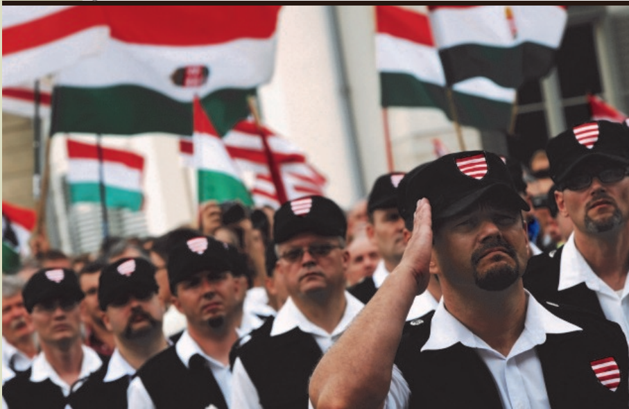
A gathering of Jobbik militants in Hungary

quarterly bulletin of research-based information on mission in Europe